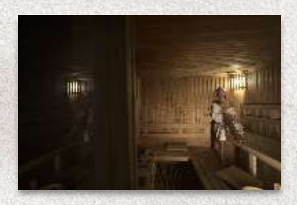
SAUNA 30 minutes THB 600