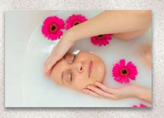
MILK BATH 30 minutes THB 1,200