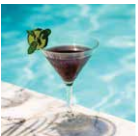
Din Hangover 240 Tequila, blue curacao, lime juice, sugar syrup, grenadine