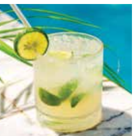
Tao Rum 245 Rum, lime, brown sugar