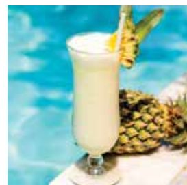
Pina Colada 275 Rum, coconut liquor, lime juice, sugar syrup, pineapple juice, coconut milk