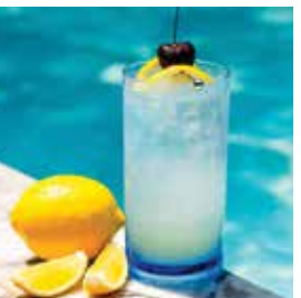
Tom Collins 275 Gin, lime juice, sugar syrup, soda, lemon