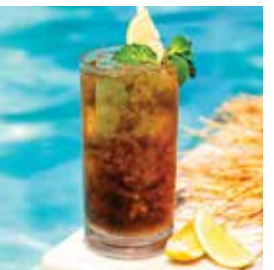
Long Island 285 Gin, tequila, white rum, vodka, orange liquor, lime juice, sugar syrup, lemon