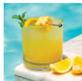
Vodktag 245 Vodka, triple sec, lime juice, pineapple juice, sugar syrup