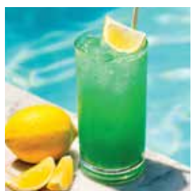
Illusion 245 Vodka, melon liquor, blue curacao, pineapple juice, lime juice, sugar syrup