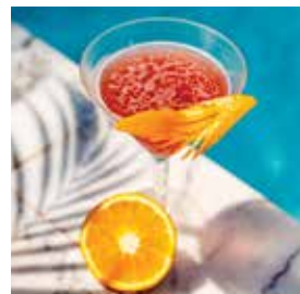
Cosmopolitan 285 Vodka, triple sec, cranberry, lime juice