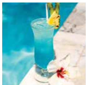
Hawaiian 240 Coconut liquor, blue curacao, pineapple juice, sprite