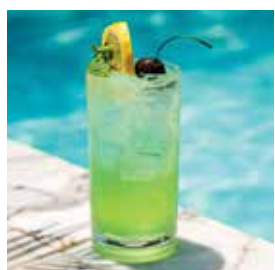
Tokyo Iced Tea 245 Gin, rum, vodka, tequila, melon liquor, lime juice, sprite