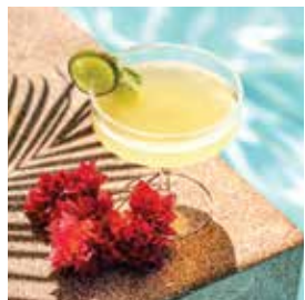
Margarita 275 Tequila, trip sec, lime juice, sugar syrup