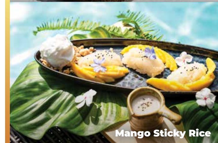
Mango Sticky Rice