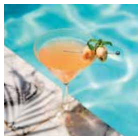
Lychee Martini 240 Vodka, lychee liquor, sugar syrup