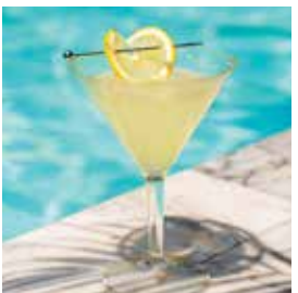
Lemon Drop Martini 275 Vodka, triple sec, sugar syrup, lemon juice