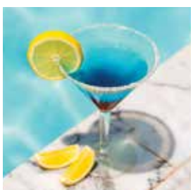
Blue Sea 240 Vodka, triple sec, blue curacao, lime juice, lychee syrup, grenadine