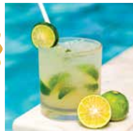
Caipiroska 275 Vodka, fresh lime wedge, white sugar