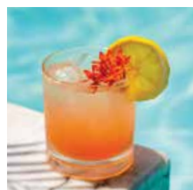
Ginney 245 Gin, triple sec, lime juice, lychee syrup, lime soda