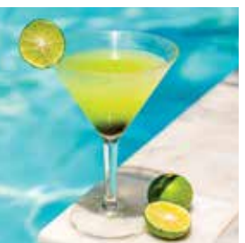
K.O 245 Rum, gin, vodka, tequila, melon liquor, lime juice, sugar syrup