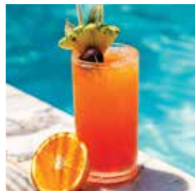
Maitai 285 Dark rum, orange curacao, pineapple juice, orange juice, lime juice, sugar syrup