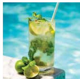
Mojito 275 Rum, mint leave, fresh lime, sugar syrup, soda