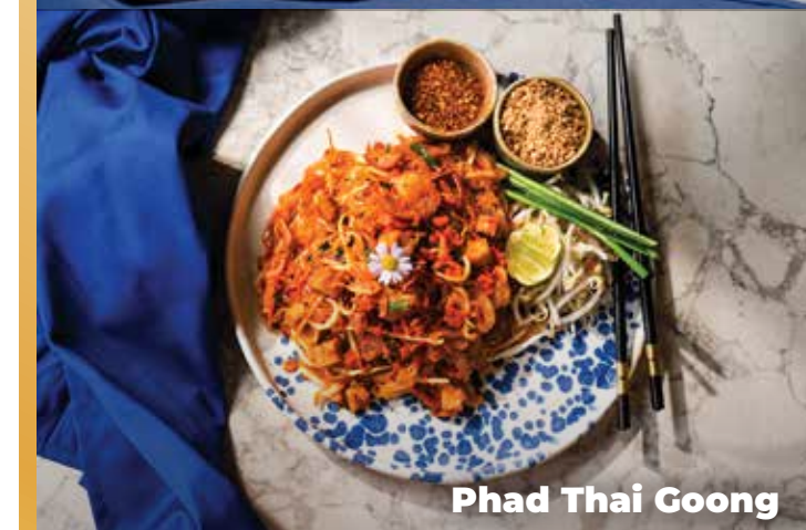
Phad Thai Goong