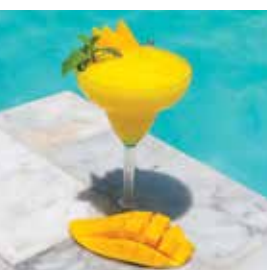
Mango Loco 240 Rum, mango puree, lime