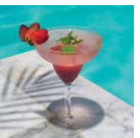
Naa Slash 240 Tequila, strawberry liquor, mint leaves, lime wedge, sugar syrup, soda water